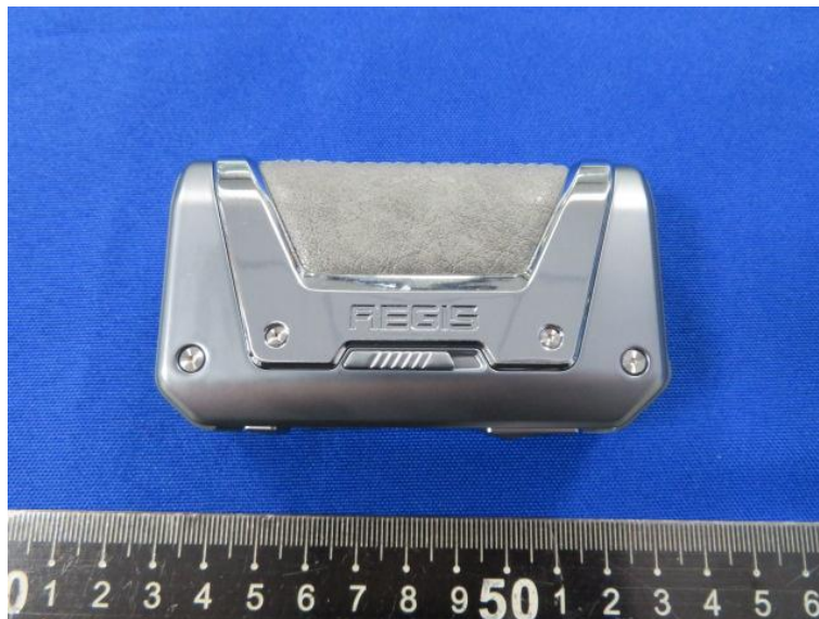
AEGIS LEGEND 2 MOD